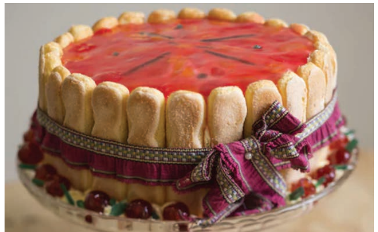
A Charlotte Russe

http://www.telegraph.co.uk/food-and-drink/recipes/the-great-british-bake-off-how-to-make-a-charlotte-russe/